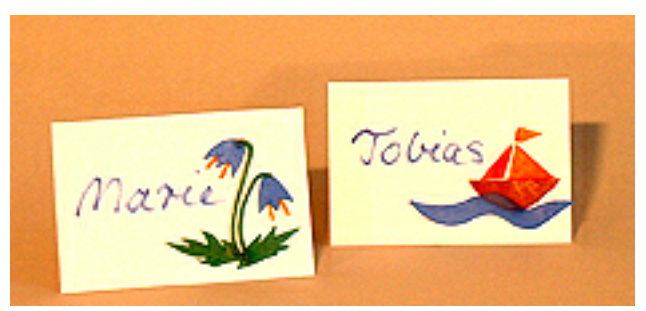
Simply Decorated Place Cards

2- Cut out pre-printed stencils (see part 6), transfer onto lightweight cardboard by tracing with pencil. Then cut out stencils, place on a wax sheet of the desired colour and cut around stencil with the knife or