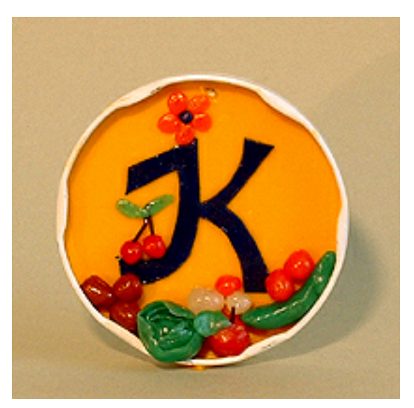
Door Sign Made from a Metal Lid

press onto the blue wax sheet, trace around and cut out with cutter (also see the TIP on page 2 of part 5). Press the letters onto the golden wax sheet.