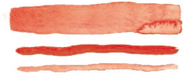
How to Use Flat and Round Brushes